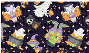
2552G-55 Tossed Motifs Glow Dark Purple

* Indicates binding fabric. FO = 18" x 22" (0.45m x 0.55m) All fabric quantities are based on 15yd bolts unless otherwise indicated.