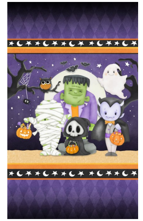
2564PG-59 24" Monster Panel Glow Multi