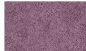
3200-55* Brushstrokes Plum