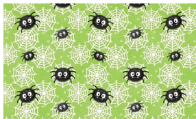
2557G-66 Spider and Web Glow Green