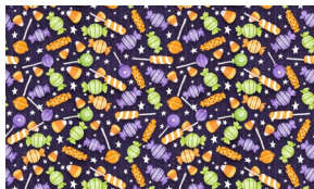
2553G-55 Candy Toss Glow Dark Purple