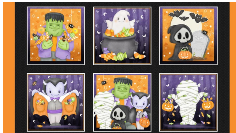
2563BG-59 6 Blocks Glow Multi