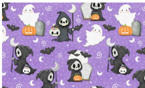
2561G-55 Grimm Reaper Glow Lt. Purple