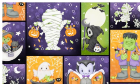
2562G-53 Monster Patch Glow Multi